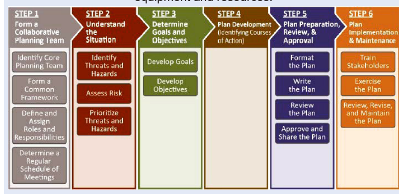
Figure 1: Steps in the Planning Process

Figure 1 depicts the six steps in the planning process. Each step in the planning process, Schools should consider the impact of their decisions on ongoing activities such as training and exercises, as well as on equipment and resources.